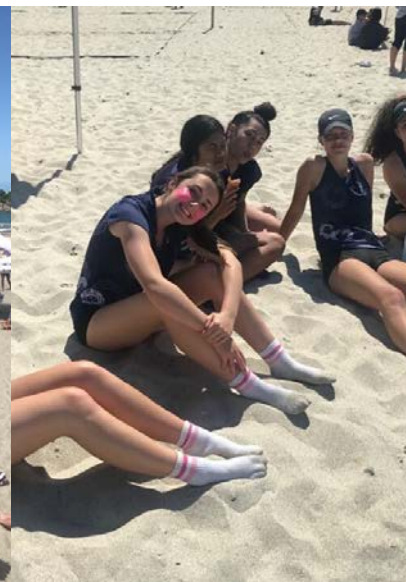
Year 10's relaxing