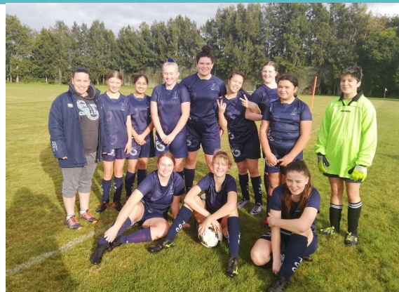
FLYERS FOOTBALL TEAM

We were excited to see all four TGC Football teams out on Saturday for their first games of the season. The Premier Team played Otumoetai College at home for a great game to score 1-4. The Development Team played an awesome game at home against Papamoa College, who had a squad of 23 players, and won 8-0. The Flyers flew to Te Puke for their first game against Te Puke 2nd XI and won 3-1.