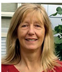
Tauranga Girls' College, New Zealand