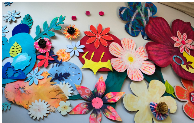
Tara Kanji Principal

Whilst we no longer have school uniform hats (fell out of trend with students), the school has invested in lots of shade cloths and large trees providing wonderful shade. Whilst most students are inside classes for most of the day and not in the direct heat of the sun, it is important your daughter keeps hydrated and out of the direct sun. At school events like Athletics Day and Swimming Sports, sun bloc is always available if your daughter forgets her own.