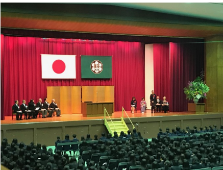
The Opening Ceremony with me congratulating students

At the end of Term One, I had the privilege of attending the Opening Ceremony at Kun-ei Girls' School, Osaka, Japan. The Opening Ceremony marks the first official school day of the new year and is a very formal occasion attended by parents, students and all teaching staff. Tauranga Girls' College has hosted senior students from Kun-ei for over two decades and it was this long standing relationship that resulted in this very special invitation.