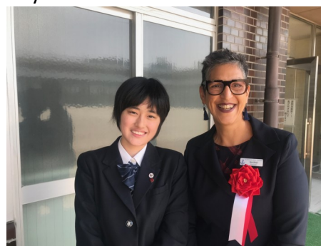
Here I am with a student from Kun-ei who spent 2018 at TGC

students, host families and of course the wrap around support of our International Department. I have thoroughly enjoyed seeing our 4 girls get involved in house spirit at swimming sports, athletic days and all the while meeting new kiwi friends and experiencing life in the lovely Bay.