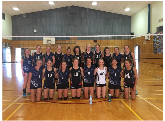
Senior A team playing St Margaret's College over the holidays