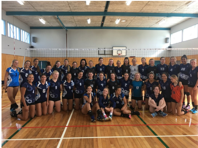
Senior A and B teams playing Trident, Long Bay and St Andrews College over the holidays.

We have four Senior and Development teams competing in the BOP champs which involves 6 days of competition to cement Senior A and B teams playing Trident, Long Bay and St Andrews College over the holidays. rankings for the NZSS.