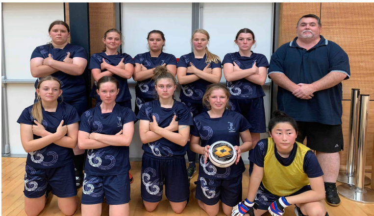
TGC Premier Futsal Team

TGC Premier Futsal Team defeated Trident College to make 3 rd place in the BOP Secondary Schools Futsal Championships on Friday 01 March at Trustpower Arena. They were narrowly beaten to 1 st and 2 nd by OTC and Whakatane. TGC Premier Futsal Team competes each Sunday afternoon in Hamilton in the Futsal Premiership Women's League 1 Division and train each Friday after school in the Sports Hall. They are heading to Wellington on 24 March to compete in the NZ Secondary Schools Futsal Championships