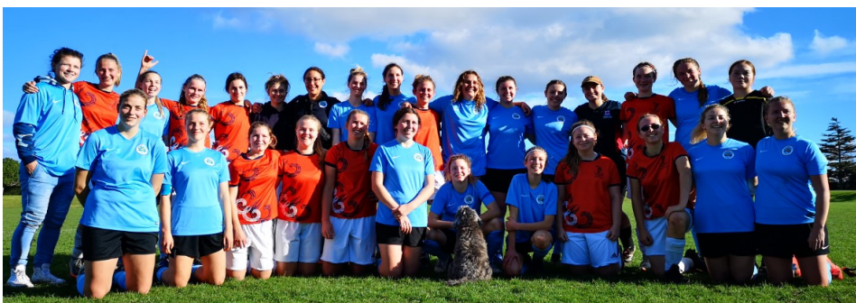
PHOTO: As part of the team's preparation, a friendly game was set up last weekend against Tauranga City Women's Federation team. A top team in the Waikato/BOP Women's League, winning the last two seasons and sitting top of the table in 2019. It was a stunning

winter's day at Links Park and the game was well contested. Although we lost on the scoreboard, we succeeded with all the rewards that a tough challenge gives.